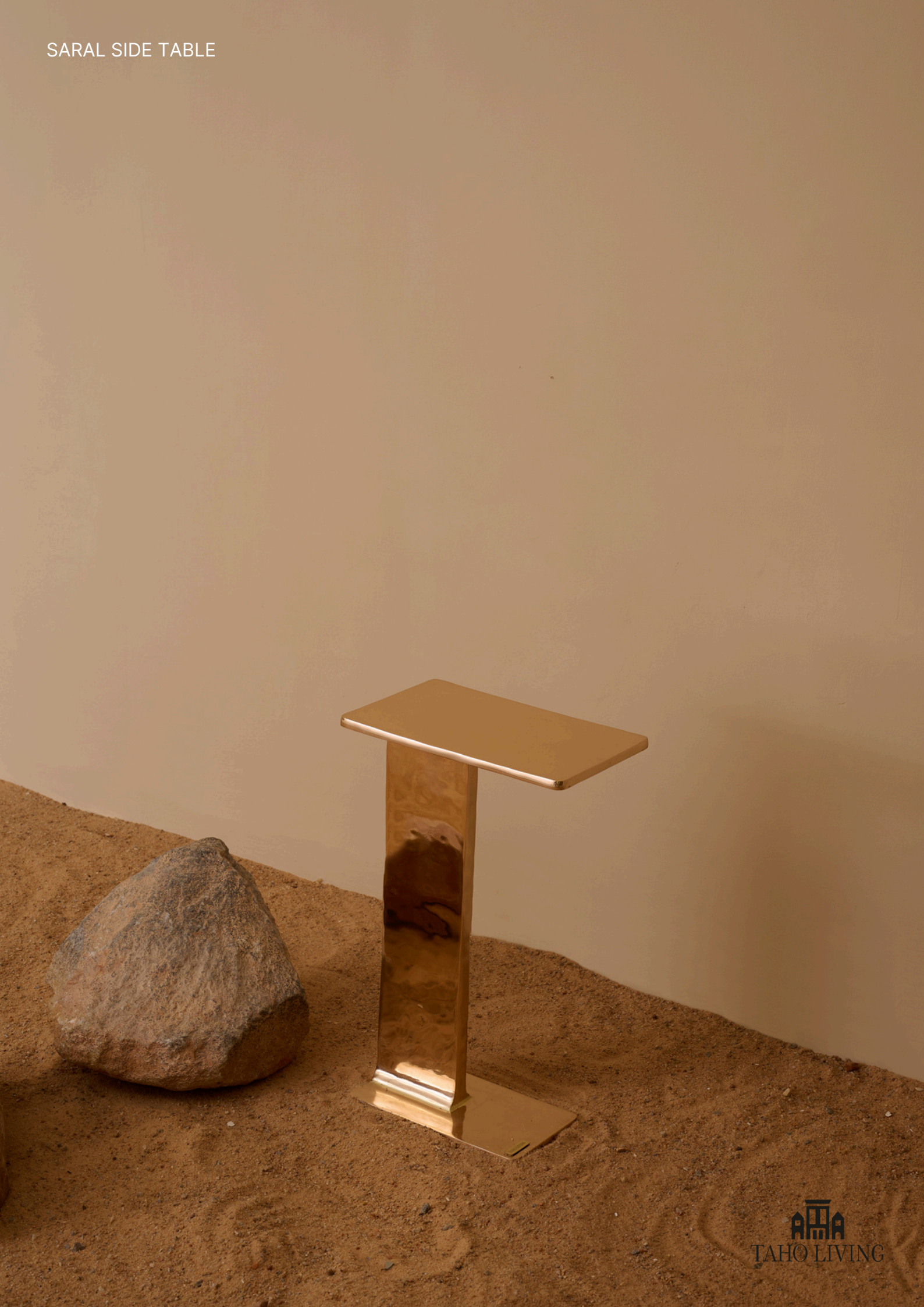
SARAL SIDE TABLE